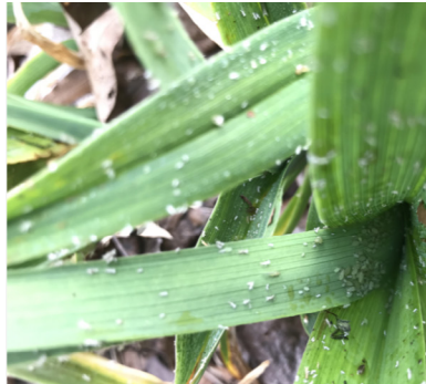
Figure 2. Aphids on daylily plants in the spring. Adults and nymphs can be seen co-existing in the whorls of the developing leaves of daylilies.