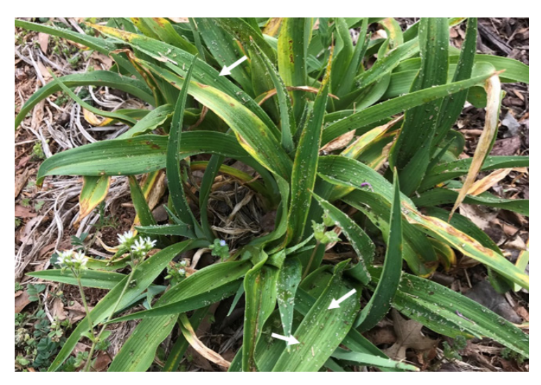
Figure 5. Nymphs shed old white skins on the leaves of a daylily plant (white arrows). The leaves turn yellow and brown after aphid feeding.

If aphid populations are severe, it's advisable to spray with insecticidal soap solution or horticultural oil to suppress the population.