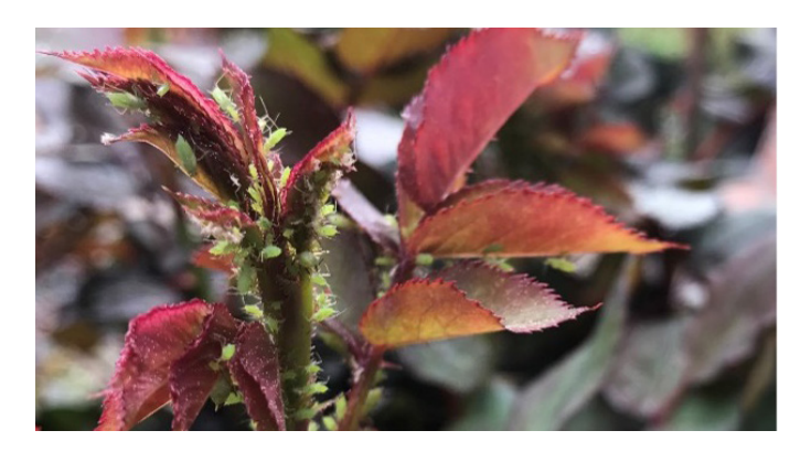
Figure 3. Aphids on rose plants in the spring.