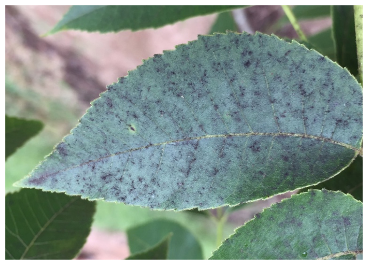
Figure 6. Black sooty mold fungal growth on the surface of a leaf.