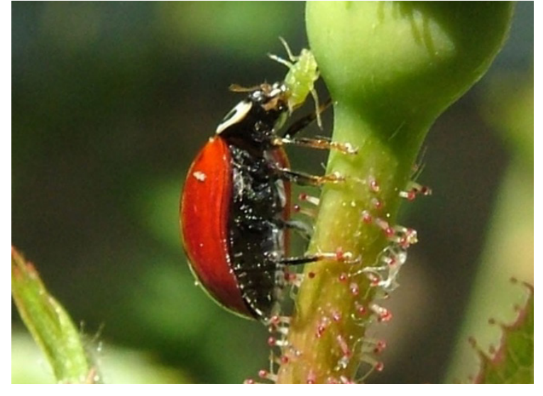
Figure 7. Lady beetle feeding on an aphid.