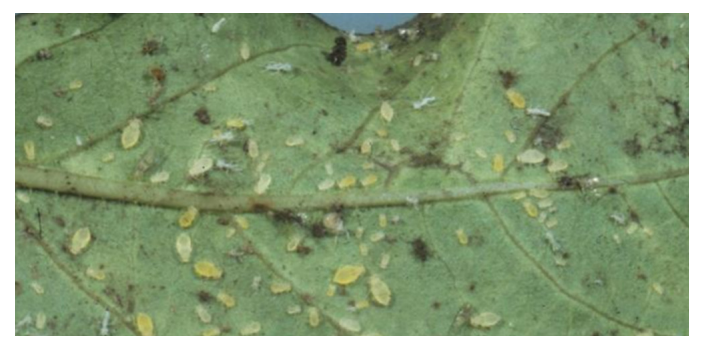
Figure 4. Aphids on a crape myrtle.