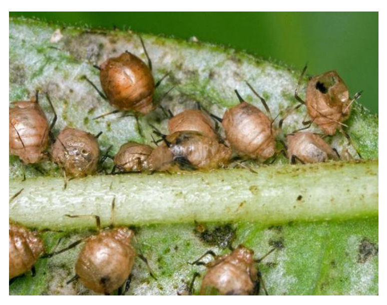
Figure 8. Parasitized oleander aphids, commonly referred to as mummies.

However, repeated applications often are necessary. Insecticidal soap solution or horticultural oil is effective only when applied directly onto the aphids. Because aphids colonize at the bases of leaves (including the unopened whorls of developing new leaves) in most cases, it's essential to fully cover them with contact insecticide. Systemic insecticides also are effective against aphids. Carefully follow the instructions provided on the insecticide label before using the insecticide—the label is the law. These insecticides also can negatively affect beneficial insects—such as the previously mentioned natural enemies and visiting pollinators. Contact your county Extension office for recommendations regarding insecticides.